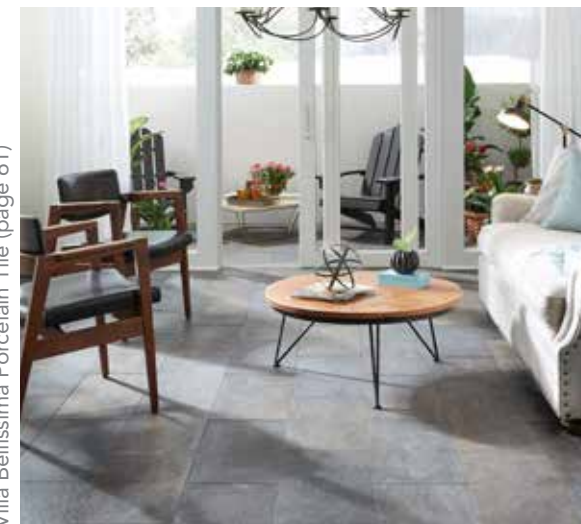
Villa Bellissima Porcelain Tile (page 61)

One of the beauties of open-concept living is that it lets in more sun for warm, natural lighting and allows you to bring the spacious, airy feeling of the outdoors in. Using earthy color tones and natural materials like wood and stone in your design scheme help complement the comforting look.