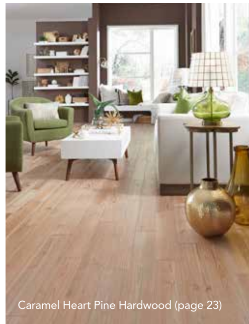
Caramel Heart Pine Hardwood (page 23)