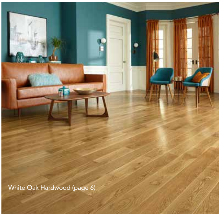
White Oak Hardwood (page 6)

If you prefer natural golden hues in flooring without the glitz, try a hardwood like new Caramel Heart Pine by Virginia Mill Works or Bellawood Natural White Oak. When paired with jewel toned wall colors and décor, you'll create a space that's rich in style .