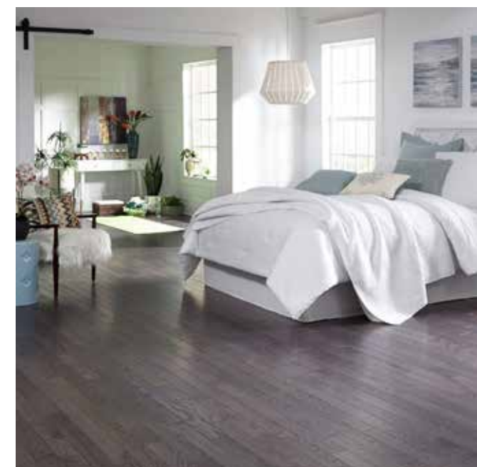
Enchanted Forest Oak Hardwood (page 26)

As we search for ways to disconnect and recharge at home, reconnecting with nature is a top interior design trend. However, even if you don't have a patio or Zen garden, you can still bring nature's beauty indoors. Use herbs in your kitchen, add greenery throughout with houseplants, hang a landscape painting, and enjoy the view outdoors by raising the window blinds or pulling back the shades. Create a personalized space that's relaxing, calming, and encourages time spent with family and friends.